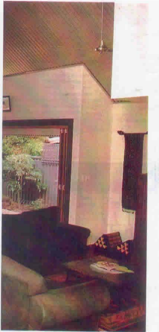
The original lounge room opens either side of the fireplace, below, to the new living area.