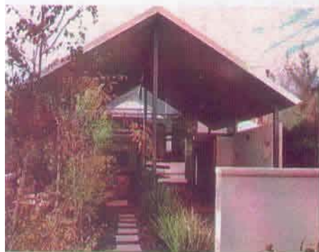
The outdoor area, above and below, is Asian-inspired, while Nico Moretti says the living area, right, is all about food and entertaining.